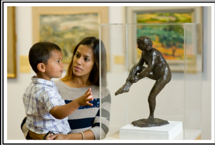
Southampton City Art Gallery

Head to Compton Bay and continue your dinosaur exploration. Visit the beach and cliffs to find relics of a pre-historic age. The Isle of Wight is Europe's most important site for dinosaur remains and continuing erosion has made these cliffs a treasure-trove for dinosaur hunters.