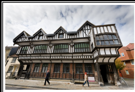
Tudor House & Garden