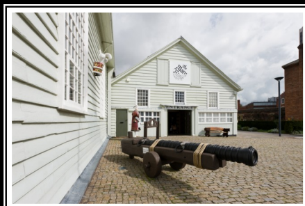
Mary Rose Museum